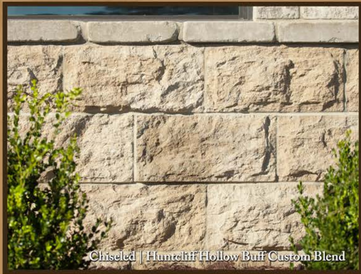
Chiseled | Huntcliff Hollow Buff Custom Blend