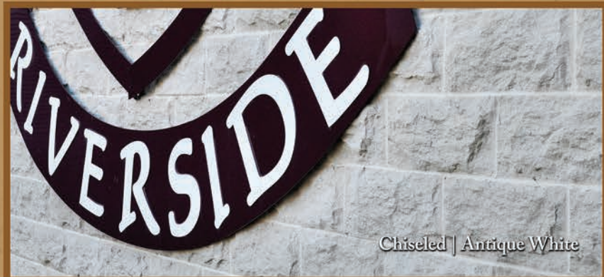
Chiseled | Antique White