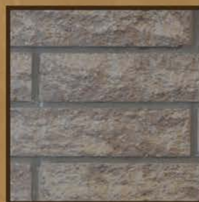
Rocky Road / Bisque Blend