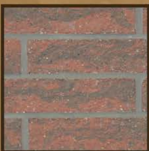
Deep Red / Espresso Blend

Due to the nature of natural aggregates, some variation is to be expected. We recommend erecting a jobsite sample panel.