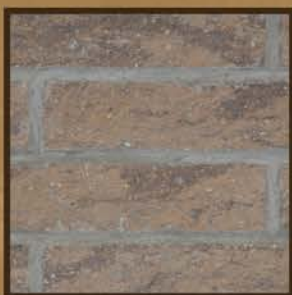
Pecan / Buff Blend