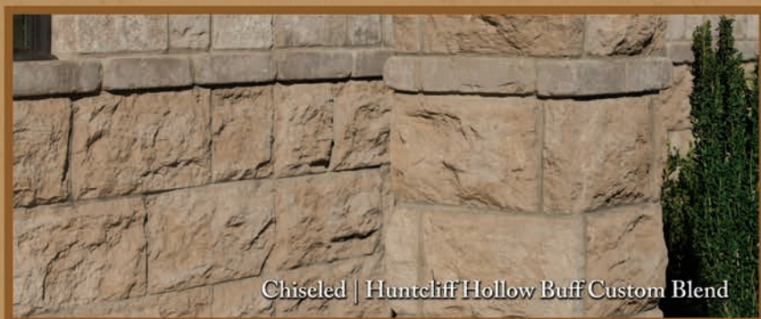
Chiseled | Huntcliff Hollow Buff Custom Blend