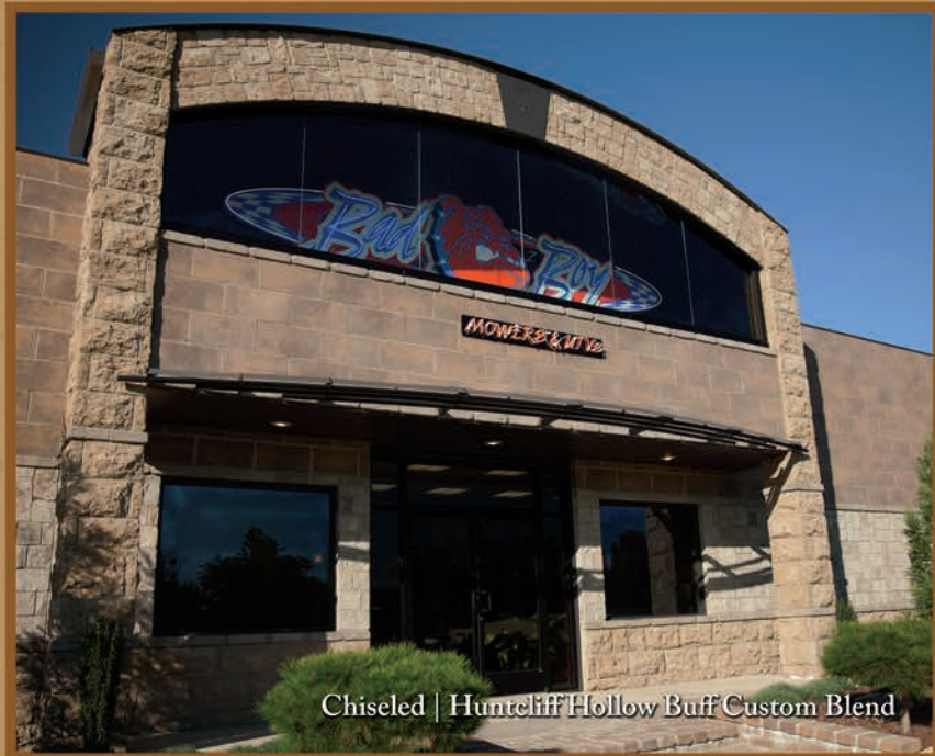
Chiseled | Huntcliff Hollow Buff Custom Blend

Nettleton Concrete Chiseled Face are manufactured under strict standards while quality control procedures ensure a consistent product of the highest quality. Chiseled Face can be produced in a single color or two-tone variegated colors enabling the designer to select expressive color combinations that enhance the project's architectural style.