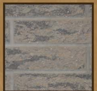
*Slate / Natural Blend

*Standard Colors feature a simplified mix design, providing a more economical solution.